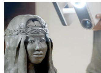
Art & Design