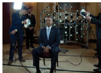
Science & Education